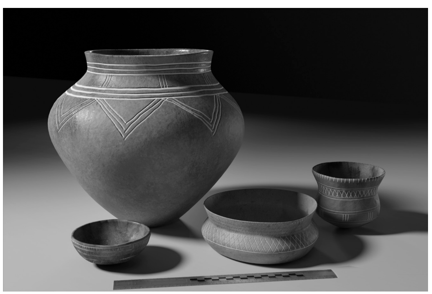
Figure 2: The exemplary set of vessels (coming from deposits discovered at site no. 3 in Supraśl), which are also registered within contexts of other discussed sites from northeastern Poland (Reconstruction 3d made by Mateusz Osiadacz).

At all the above-mentioned sites, fragments of pottery from individual vessels were identified. This is best emphasized in the case of closed contexts, i.e., features from sites no. 3 and no. 6 in Supraśl and features from site X in Ząbie. In the first two cases, the discovered fragments seem to have been selected and deposited in symbolically engaged deposits<sup>22</sup>. In the case of features from Ząbie, the presence of specific fragments of vessels is more random. Nevertheless, it seems to be an effect of a