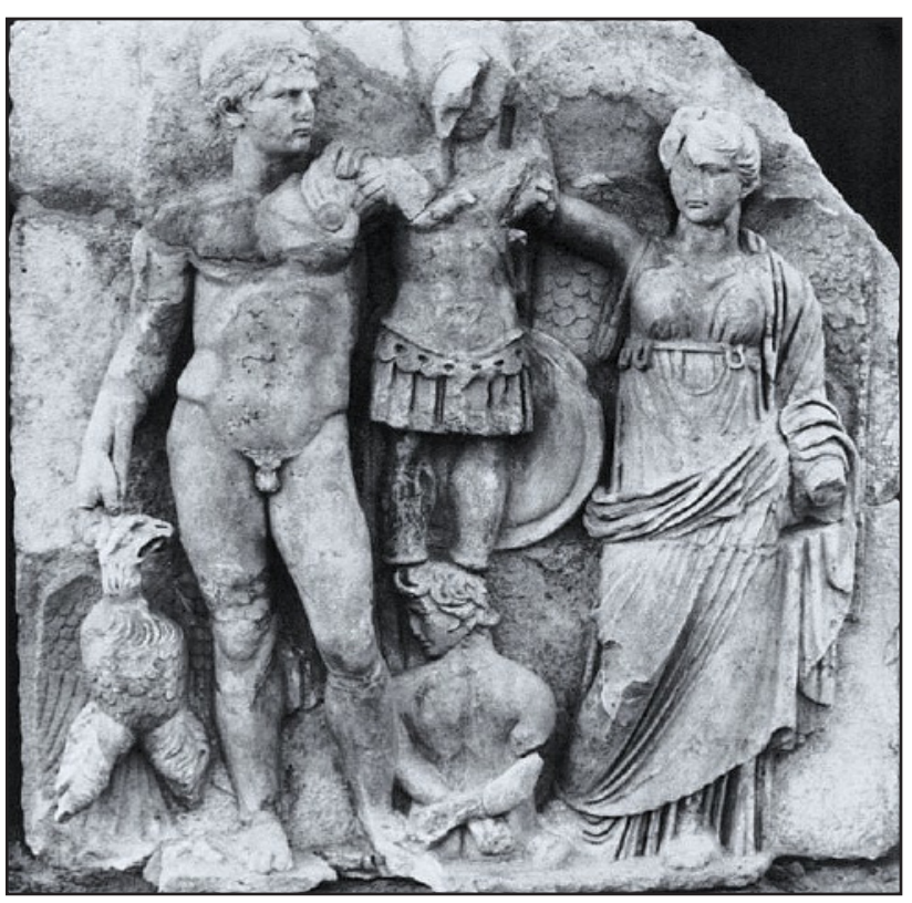
Figure 2: Augustus, Nike, and Trophy, South Portico

leaders were given "honors equivalent to the gods," or isotheoi timai, meaning that they were venerated and bestowed sacred honors, but acknowledged as mortal men; the key word is 'equivalent,' indicating a level of separation between emperor and god.<sup>15</sup>