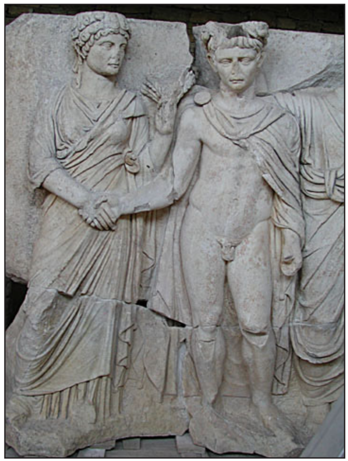
Figure 3: Claudius and Agrippina, South Portico

accomplishments, and the positive changes they brought to the East.