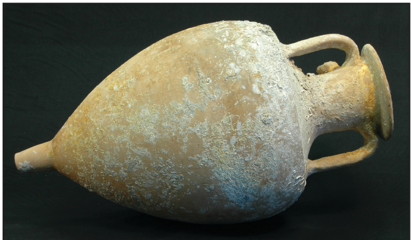
Figure 2: ‘B’ Amphora (MU4666)

The body is a globular turnip shape with a sharp carination at the shoulder (fig. 2). The solid-made ‘peg’ toe is also joined to the body at a sharp angle and has a flat and angular base. The strap-like handles attach just below the rim, are slightly arched at their peak and then flow vertically down to attach again midway up the shoulder (appx.1.2). The rim is a flattened disc shape with a slight concave shape on its underside and a slightly rounded lip. It is important to note that there is evidence of sealant in two locations: first, inside the vessel in limited patches of a black color which are fading yet still visible to the naked eye and second, on the top surface of the rim and appearing as a crystalline, black concretion,