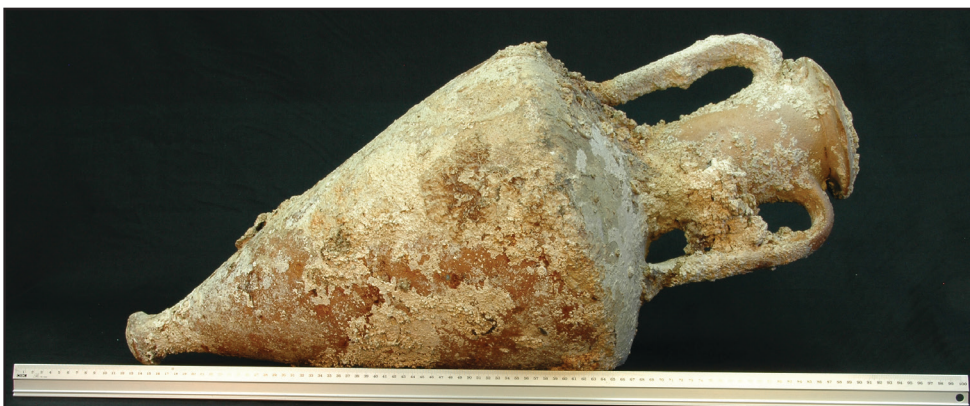
Figure 1: Mendeian Amphora (MU4639)

This amphora has a turnip-shaped body with a sharp, somewhat carinated, shoulder (fig. 1). The rim tapers down and outwards from the lip to a sharp point and then changes direction to join the neck with a slightly concave curve. The strap-like handles attach to the long, cylindrical neck just below the rim, rising slightly and then continuing almost vertically downwards to join the body in between the base of the neck and shoulder. The body tapers down from the shoulders and flows into a short-stemmed, flaring or splayed toe with a deep depression underneath (appx. 1.1). It also includes a small carination near its base in the form of a thickened and raised band of clay.