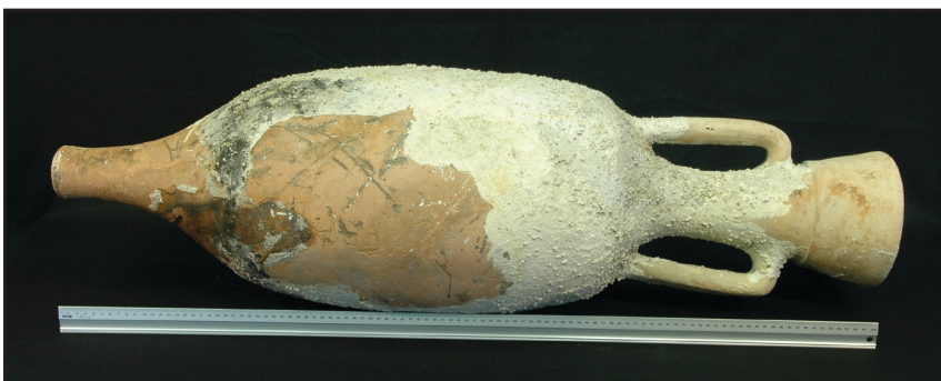
Figure 3: Pascual Amphora (MU4640)

MU4640 has an ovoid body with a long rim, neck and elongated toe (Appx. 1.3). The toe is a slightly splayed peg toe and the rim is thickened in a slightly everted (or funnelled) collar shape (fig. 3).