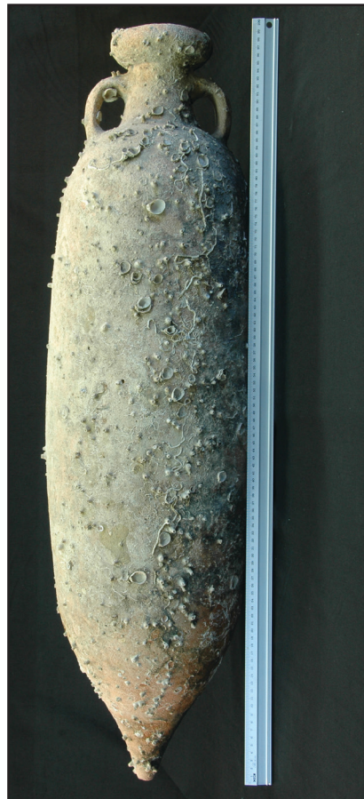
Figure 5: African 1 Amphora (MU4616)

This widespread distribution, along with the lack of detailed scientific study, makes it difficult to determine a provenance of any kind for MU4640 with any confidence. The concretions and small-scale barnacle encrustations reveal that it was discovered in a marine context and, if being used for its primary purpose (transporting wine from the coastal Catalan region or Gaul), it may be suggested that its trading route may have passed through the western Mediterranean Sea or even the Bay of Biscay or English Channel; en route to North Africa or Britain respectively. Further scientific biological analysis on the marine encrustations may serve to narrow this down to one generalised geographical region and potentially reveal the trade route on which MU4640 was travelling.