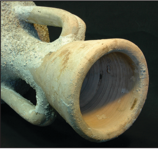
Figure 4: Pascual Amphora (MU4640) - Rim and Handle Detail

It has a significant carination along its lower edge where it joins the neck and has a rounded upper edge. The handles begin below the rim's lower edge and attach midway up the shoulder of the vessel. They are strap-like, almost rectangular, in profile and have a deep groove running down the middle of the outside edge (fig. 4). There is evidence of stoppering on the interior of the neck just before the shoulder, where an indent or shallow mark approximately 1.0cm wide can be observed with residues of glue or sealant within, most likely to cement the stoppering mechanism in place and provide a hermetic seal. Thick parallel lines running around the interior of the rim and neck and continuing to the shoulder suggest manufacture and construction on a potter's wheel (fig. 4).